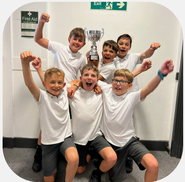
Eastbourne Town FC Under 10's – Heathfield and Horam Cup Champions. The team played 7 games altogether, scoring over 30 goals throughout the tournament – only conceding 2 goals! They went unbeaten, and came out as champions! Well done to the Year 5 boys on their great success.